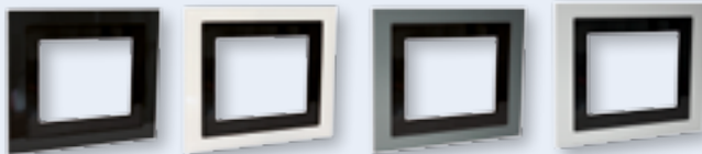
Glass frame black Glass frame white Metal frame Stainless steel Metal frame Aluminium